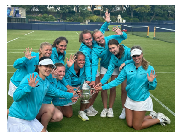
Our amazing Ladies triumph again!

Another wonderful week of tennis on Devonshire Park's lush grass courts in Eastbourne in late July saw our Ladies team crowned National Summer County Cup champions for a mind boggling 5th year on the trot!