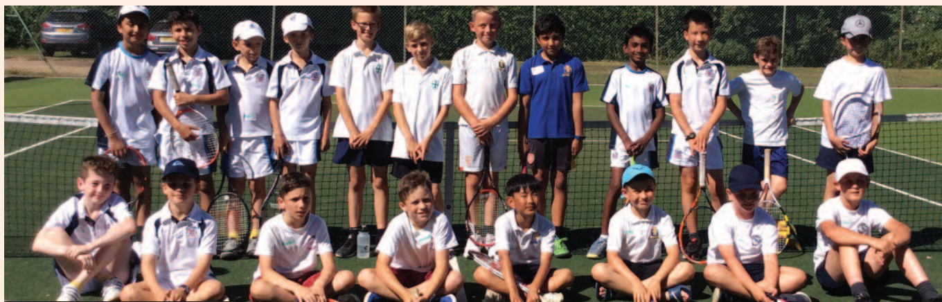
2018 Mini Green competitors