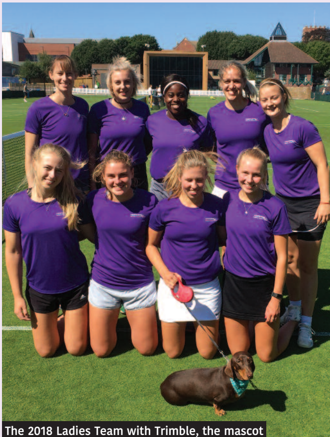
The 2018 Ladies Team with Trimble, the mascot

The second day was another scorcher – and with sun cream caked on, and a day playing across the show courts at Eastbourne, we were ready to take on a strong Essex side. The first round was a long one, and we found ourselves 2-1 down after narrowly missing out at number 3 with Indi and Georgie losing a close third set battle. The second round saw even more long rallies and games as the ladies pushed hard – despite our best efforts we found ourselves with our backs against the wall at 4-2 down with the last round remaining.