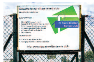
New signage at St Pauls Walden TC - before and after