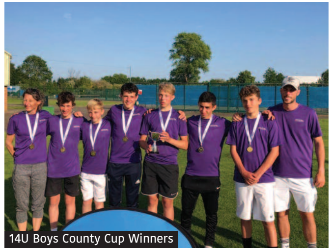
14U Boys County Cup Winners

The 2018 County Cup season got under way with our U18s. The boys were again competing in division 1, they finished 2nd nationally and the girls won promotion from division 2a meaning both teams will be in the top division in early 2019. The end of the Junior County Cup calendar saw our U9s win