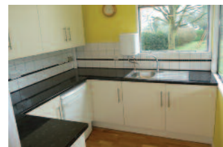
Dellcott Tennis Club kitchen refurbishment - before and after