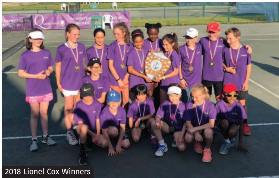
2018 Lionel Cox Winners

The early May Bank Holiday weekend saw our U9s, U10s and U12s come together to compete in the annual Lionel Cox Tournament at Queenswood School. Hertfordshire have a strong history in the competition and this year that strength was proven with both outstanding individual performances on court and superb team work and support off court. The