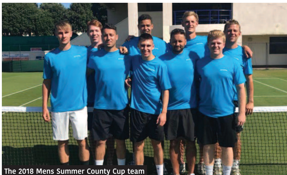
The 2018 Mens Summer County Cup team

As round 3 started only one result was possible and that was that Essex had to win all 3 matches to win for their first title. With Suffolk hoping Herts would win one match to complete their victory, it was a very strange ending as Bamford