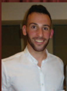
Langley Tennis Club