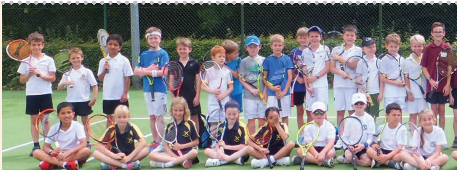
2016 Mini Orange Tournament competitors