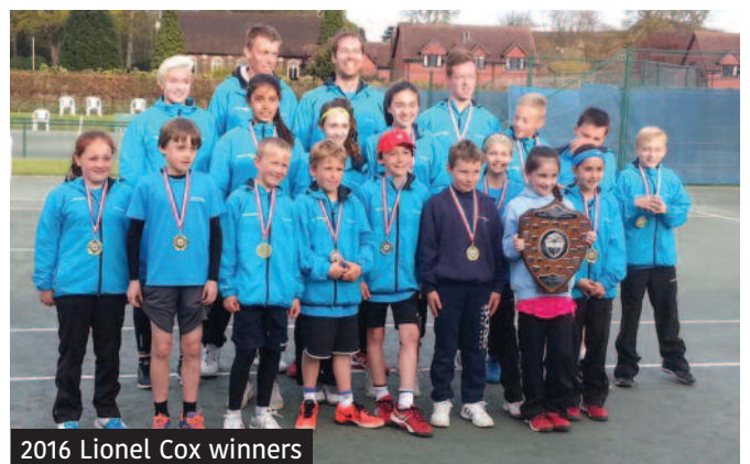
2016 Lionel Cox winners

The Lionel Cox event is a popular fixture in the county events calendar which sees 10 counties field a team of 3 boys and 3 girls in each of the 9U, 10U and 12U age groups competing over a 2 day weekend. Herts are proving to be a dominant force in this annual event and 2016 proved to be another great year with superb individual performances and a fantastic team spirit resulting in Herts once again lifting the trophy.