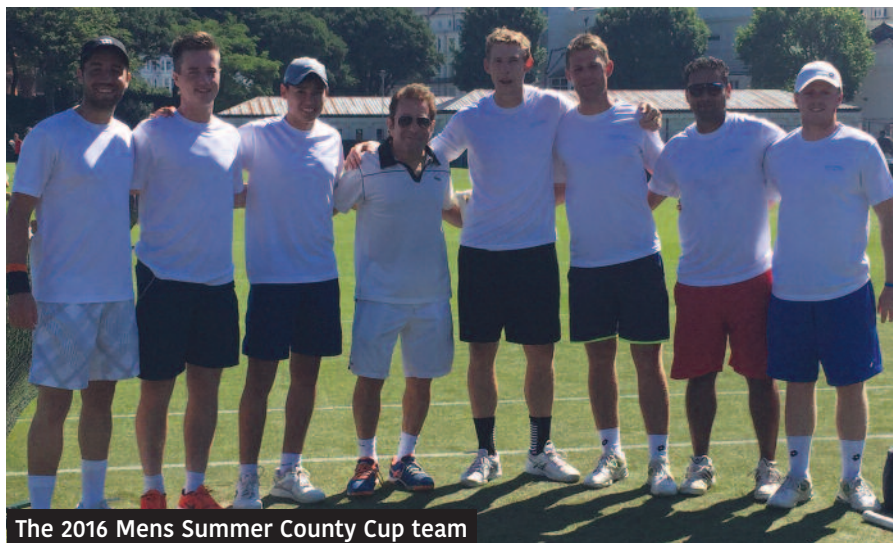
The 2016 Mens Summer County Cup team