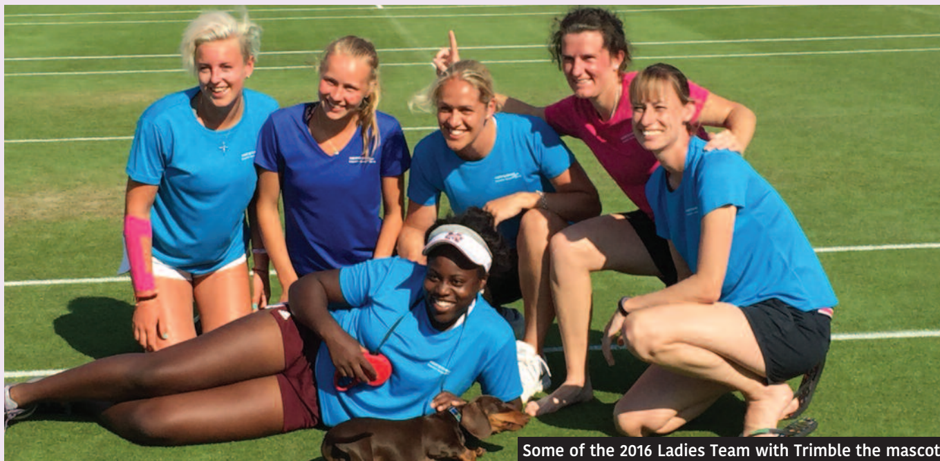
Some of the 2016 Ladies Team with Trimble the mascot

Here's to 2017 in group 1 again – we are looking forward to it already!