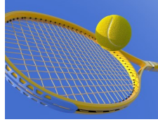
More Herts clubs welcome Ukrainian refugees