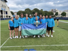
County Week Success