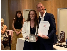
2022 Awards Evening