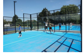
Broxbourne opens its new Padel courts