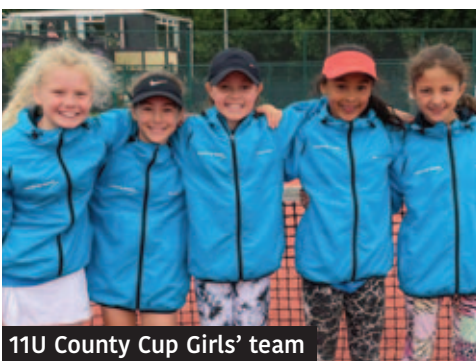
11U County Cup Girls' team