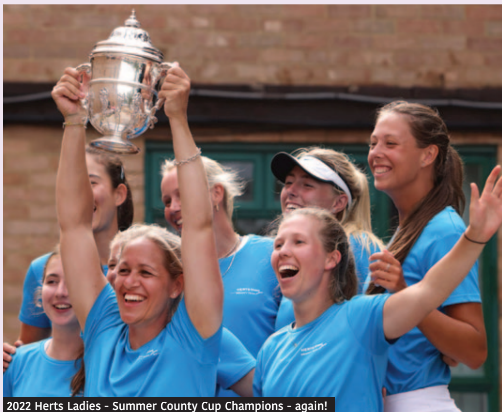
2022 Herts Ladies - Summer County Cup Champions - again!