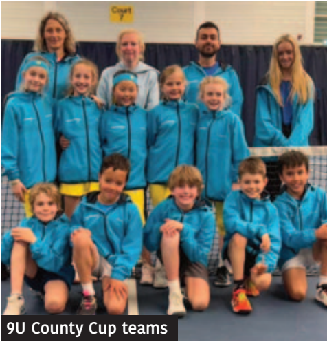
9U County Cup teams