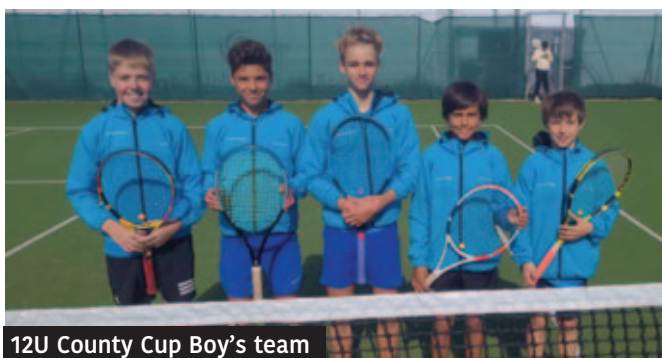
12U County Cup Boy's team