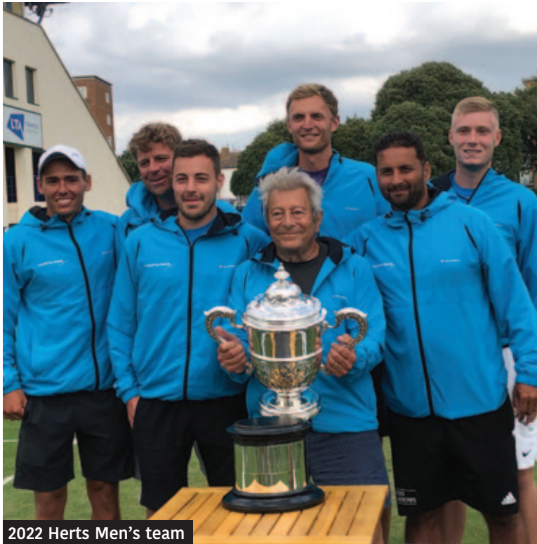
2022 Herts Men's team