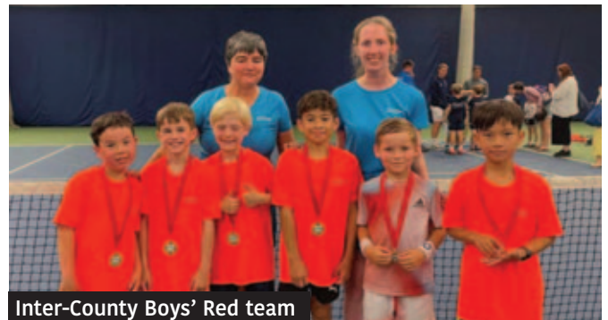
Inter-County Boys' Red team