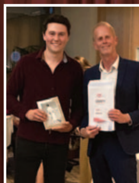
St Albans School