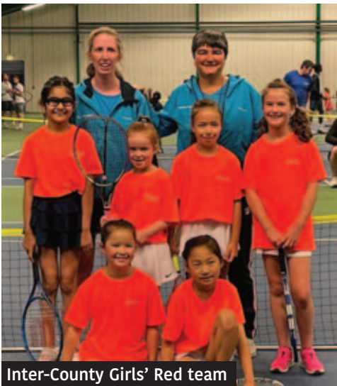
Inter-County Girls' Red team