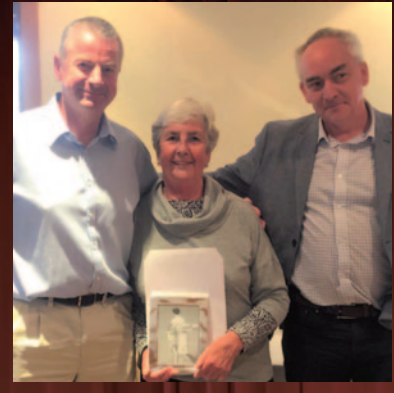
Watford & District League

After two years of not being able to hold our annual awards event, we were delighted to be able to acknowledge and award our deserving winners for 2020 and 2021 at a special afternoon tea held at Tewin Bury Farm Hotel in Welwyn Garden City in August.