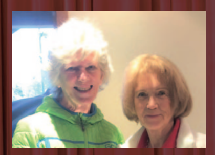
Herts Ladies Seniors Doubles League