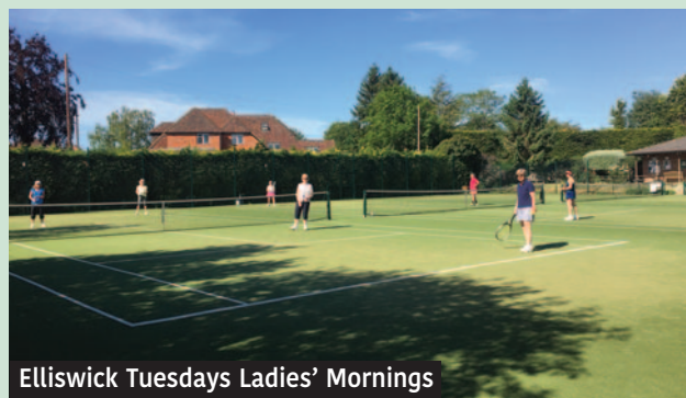
Elliswick Tuesdays Ladies' Mornings

So, all in all, despite the 2020 Covid-19 pandemic, we have not