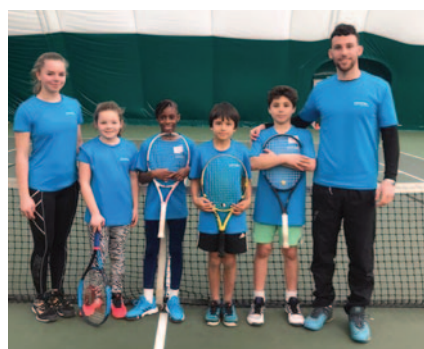
U9 Mini Orange Festival WINNERS