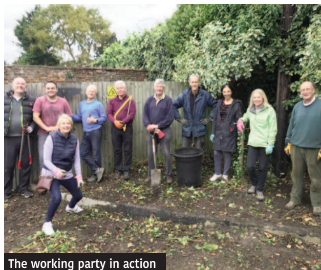
The working party in action

With indoor facilities having to close over lockdown we had a noticeable increase in our membership and it is hoped many