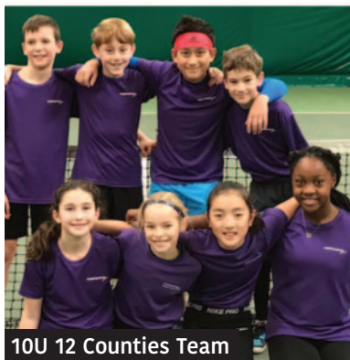
10U 12 Counties Team

The annual 12 Counties event takes place over six months between October and March and sees county teams of 4 girls and 4 boys compete in singles matches in