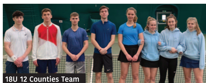
18U 12 Counties Team