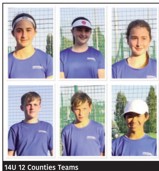
14U 12 Counties Teams

efforts Middlesex took the win. The captains reported great teamwork and Herts spirit both on and off court throughout the weekend and all can be very proud of their efforts.