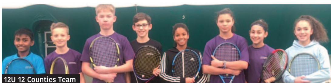
12U 12 Counties Team

The Herts girls were first to play in the 2020 Mini-Red East Region competition and they got the Herts 8U off to a great start! They performed very strongly in their round robin group versus Suffolk, Bedfordshire and