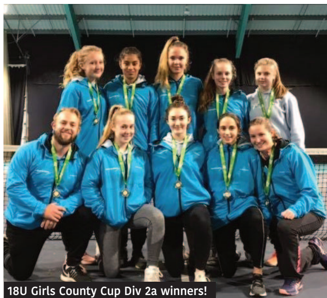
18U Girls County Cup Div 2a winners!

Norfolk and progressed to the semi-finals as group winners. In the semi-final the girls battled hard against an improved Berkshire team and won the match to set up the final versus Essex. The final was a very close match; the girls had to draw on all the skills they had practiced in training and their fantastic efforts saw the match finish in a 3-3 tie resulting in the need for a point count back to determine who would claim the gold medals... after some complicated maths it worked out that Essex had pipped Herts by 1 point! Our girls were brave, focussed and determined from start to finish and can be enormously proud of their silver medals.