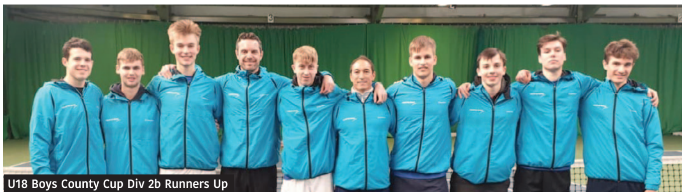
U18 Boys County Cup Div 2b Runners Up

and illness and despite the challenges on and off court the girls displayed great resilience and determination. There were fantastic individual and doubles performances, shrewd tactical decisions from the captains and some nail-biting matches. The girls won all three ties versus Dorset, Avon and Somerset to gain promotion back to the top division.