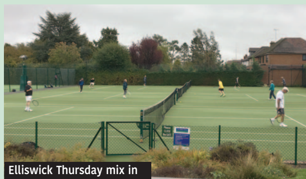
Elliswick Thursday mix in

had a bad year. We believe that the future of our club is bright and we are continuing to advise our members to play tennis, maintain hygiene and minimise unnecessary interactions with others. We also encourage our members and visitors to be fully compliant with the national rules as well as the LTA and ELTC rules.