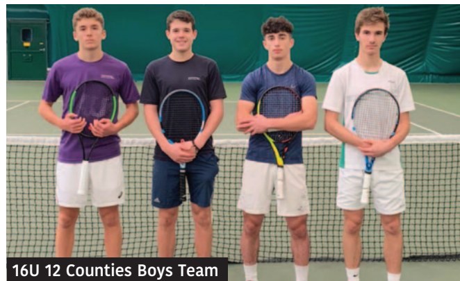
16U 12 Counties Boys Team

The boys put up a great fight but despite all their best-