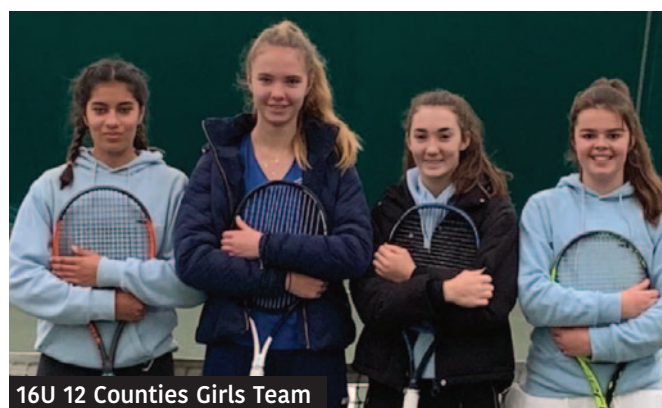
16U 12 Counties Girls Team