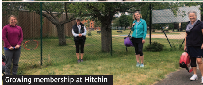
Growing membership at Hitchin

indeed these will continue to be offered throughout the winter. The focus being on the benefits that tennis brings to both mental and physical well-being.